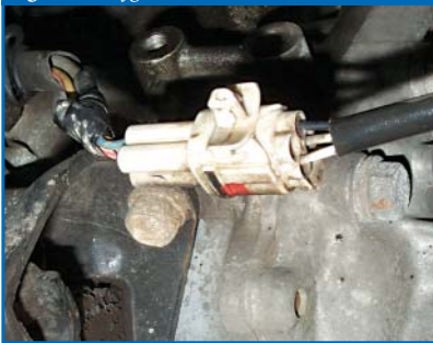
Figure 1: Oxygen Sensor Connector

The factory service information available for our Subaru was only partially helpful. Most of the information assumed the use of the Select Monitor — the Subaru-specific scan tool. The Select Monitor allows access to enhanced scan tool data, including an amperage test of the heater element. We did not have the Select Monitor, but we used the manual's circuit diagram and normal resistance values for the oxygen sensor heater. After locating the oxygen sensor harness connector near the transmission (Figure 1), we verified a heater element open circuit.